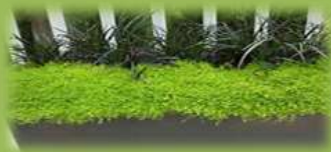
(Scotch Moss with Black Mondo Grass)