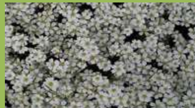
Snow in Summer